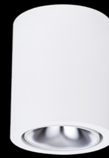
WHITE/SILVER HIGH GLOSS