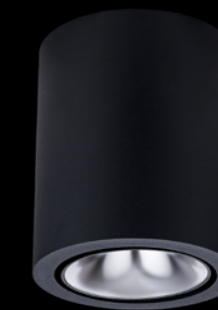
BLACK/SILVER HIGH GLOSS