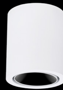
WHITE/BLACK HIGH GLOSS