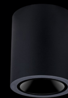
BLACK/BLACK HIGH GLOSS